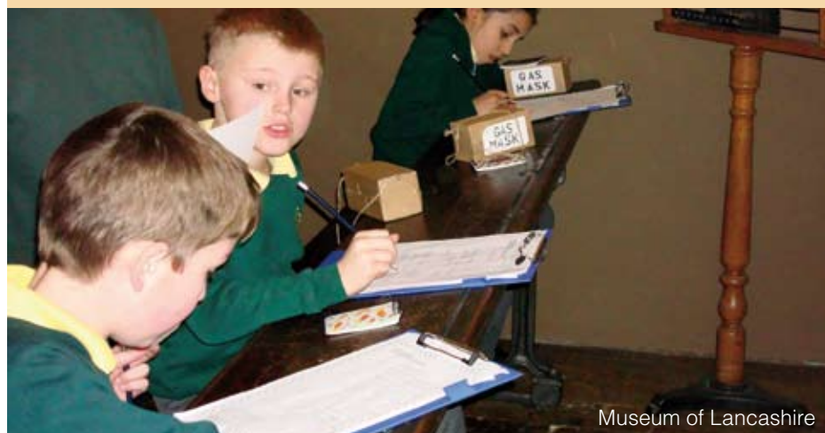
Museum of Lancashire