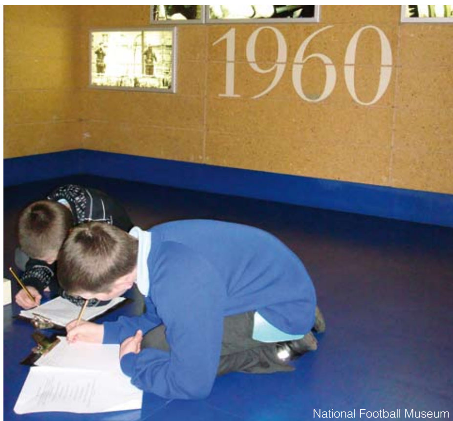
National Football Museum

“All I have to do [is] mention Light and Shadows [the name of the museum project] - it's something they can talk about - it's always there. I can use it as an initial start to a lesson. There's a range of things that they can talk about. They can use their strengths...”