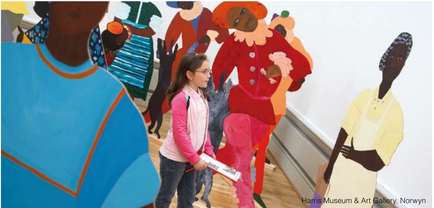
Harris Museum & Art Gallery, Norwyn