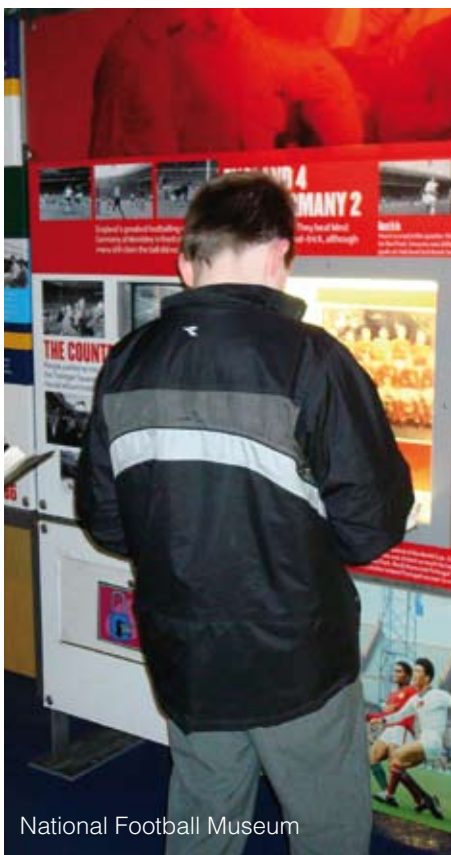
National Football Museum