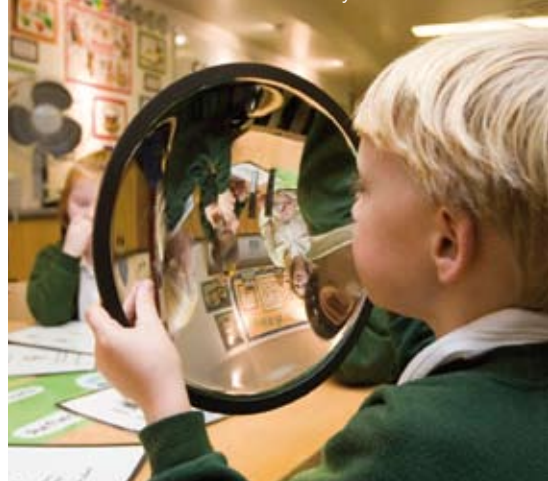
Museum of Science & Industry